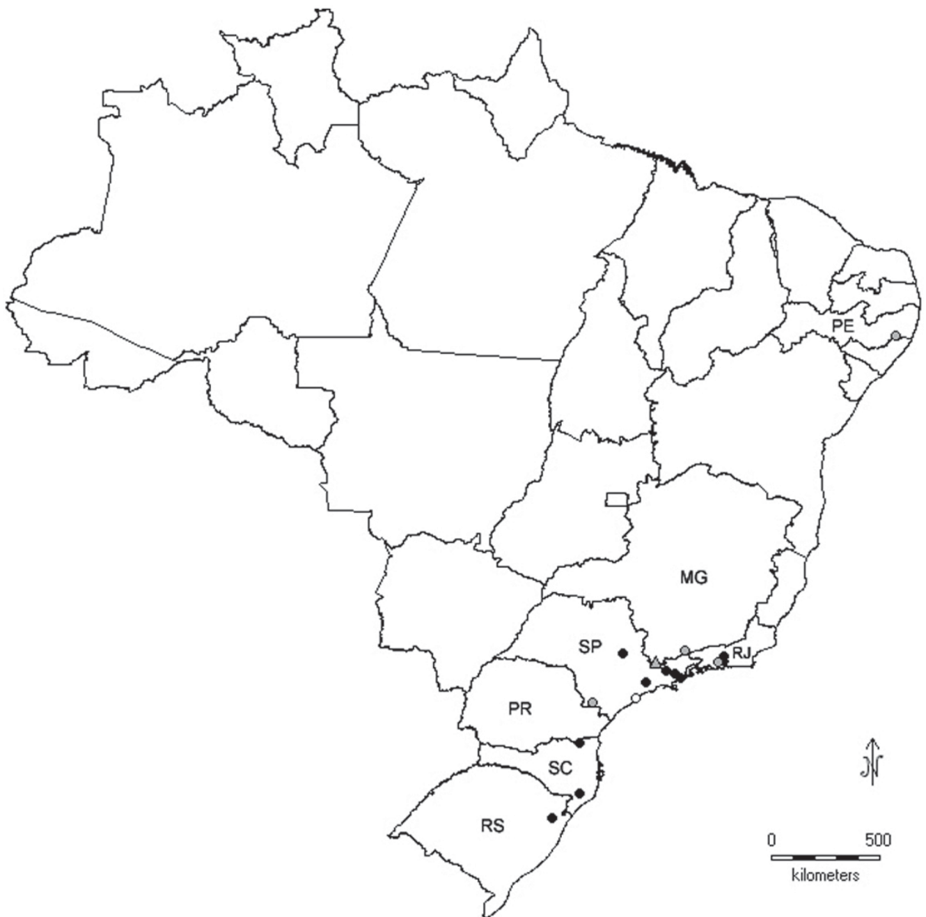
Figure 1: Distribution of Batrachochytrium dendrobatidis in Brazil. Dark circles indicate infected populations reported by in the present study; gray circles indicate infected populations reported by Carnaval et al. (2006); the gray triangle is the same locality (Camanducaia, MG) reported by Toledo et al. (2006) and in the present study; and the white circle is the same locality (Peruíbe, SP) reported by Carnaval et al. (2006) and in the present study.

ests (e.g., Heyer et al. , 1990; Pombal Jr. and Haddad, 2005). This habitat seems to be the most probable to find B. dendrobatidis (e.g., Lips et al. , 2005; Carnaval et al. , 2006; Toledo et al. , 2006), even though this fungus can also be found in open area ponds (Herrera et al. , 2005; present study). Nevertheless, our results are consistent with the previous predictions made for South America, especially that the fungus